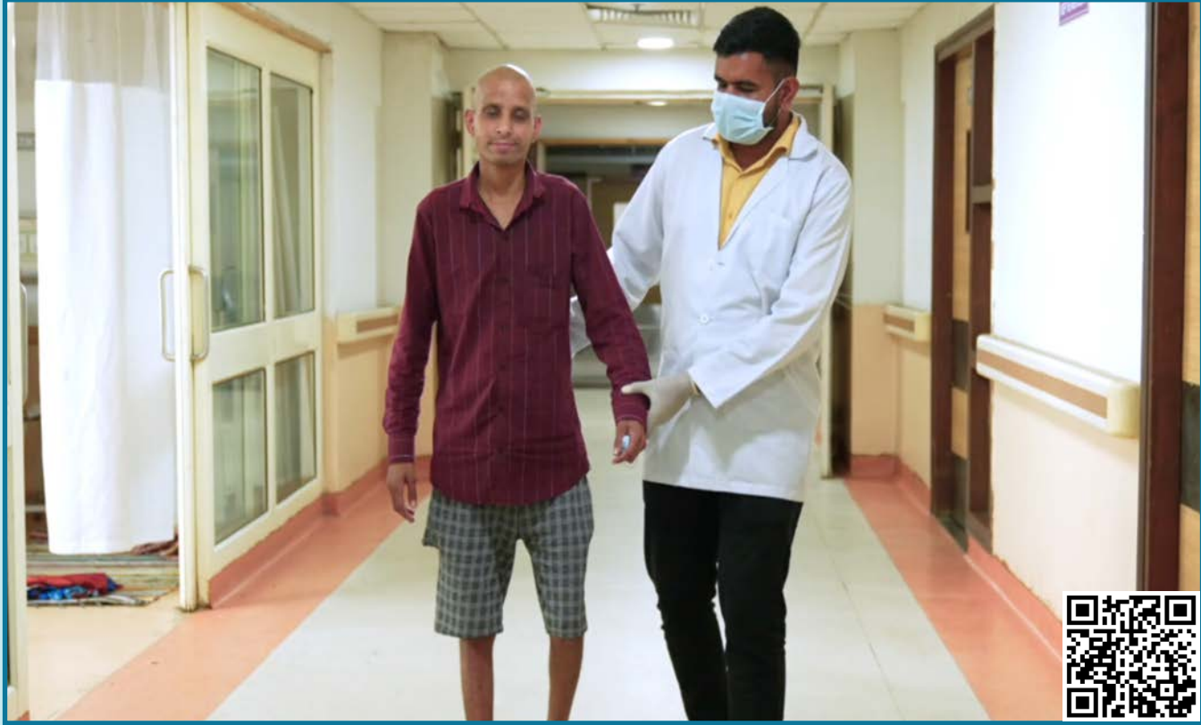
अधिक जानकारी के लिए स्कैन करें।