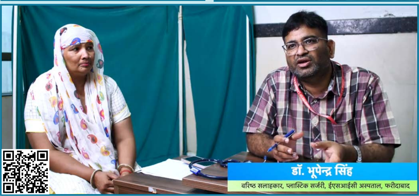
Scan for more details