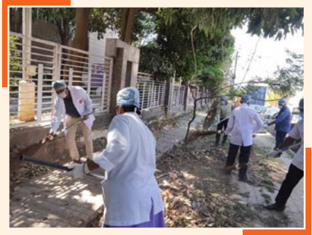
ESIC Hospital Peenya, Karnataka