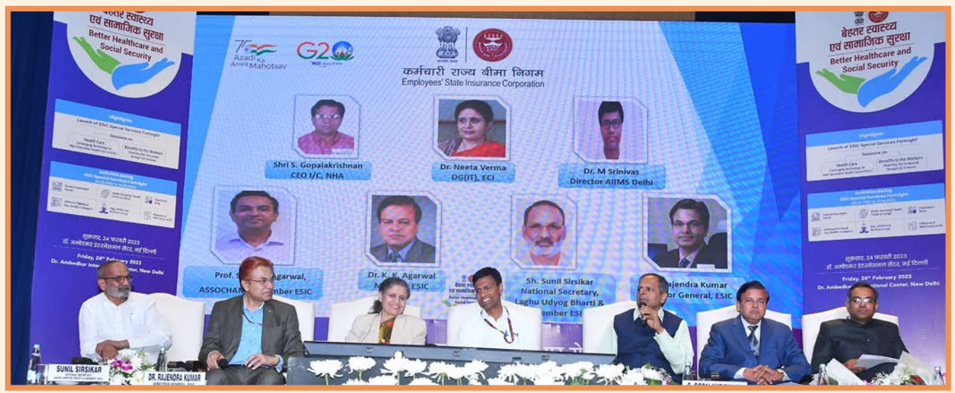
Session 2-Health Care: Leveraging Technology for Next Generation Health Care in ESIC

The discussions focused on the role of information and communication technologies in leveraging technology for better outcomes in the health sector and increasing the outreach by bringing the workers of the unorganized sector under the ambit of social security schemes.