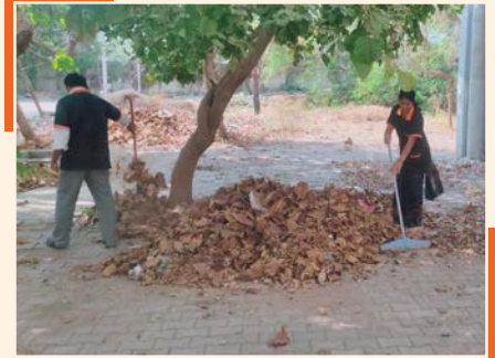
Dental College, Kalaburgi, Karnataka