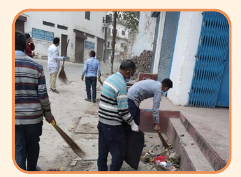
Baddi, Himachal Pradesh