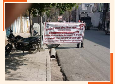
Jajmau Kanpur, Uttar Pradesh