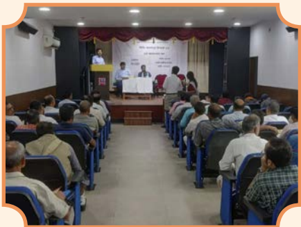
Kolkata, West Bengal