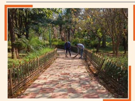
Rajajinagar Bangaluru, Karnataka