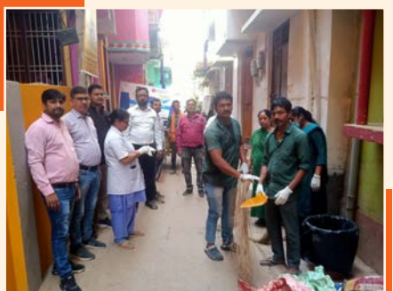
Phulwari Sharif, Bihar