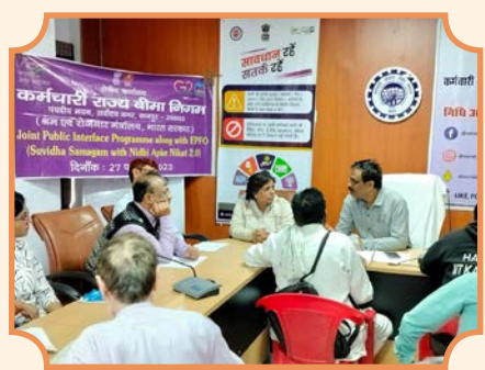
Kanpur, Uttar Pradesh