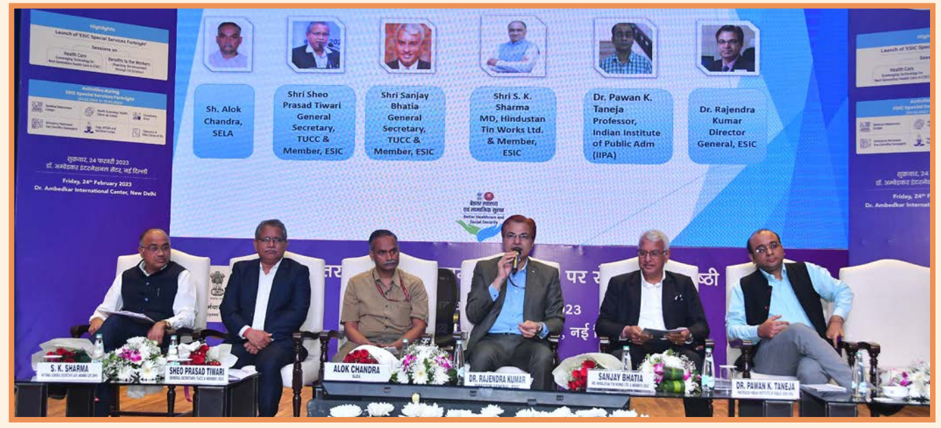
Session 3-Benefits to the workers: Reaching the Unreached' through ESI Scheme