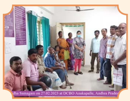
Annakapalle, Andhra Pradesh